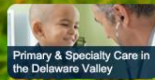
Primary & Specialty Care in the Delaware Valley