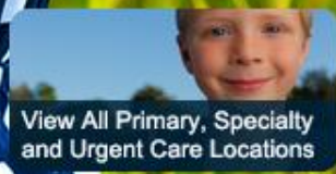
View All Primary, Specialty and Urgent Care Locations